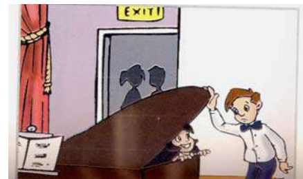
angry - sad .....