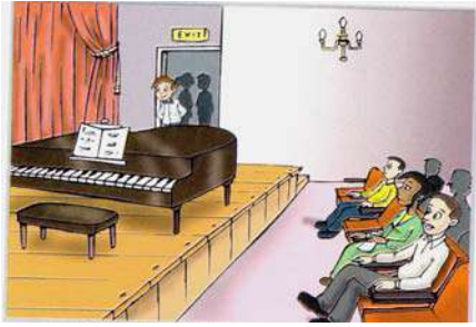
Tom - piano - theatre .....

Write a sentence under each picture describing it :