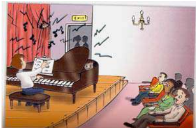
Couldn't - bad .....