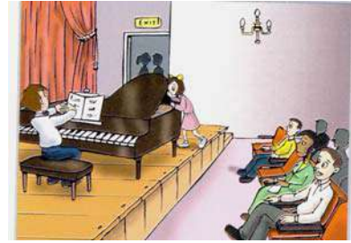
Tina - naughty - hide .....