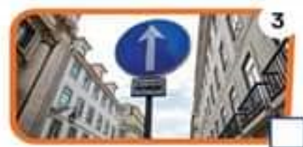
go straight on