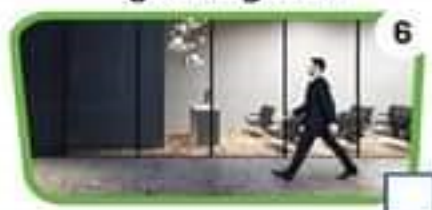
walk past the...