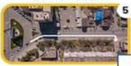
take the second road on the right