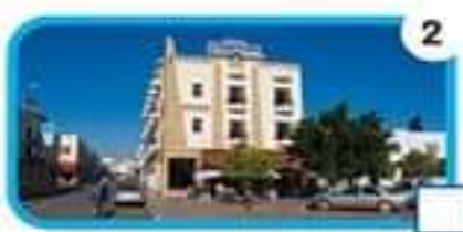
It's on the corner